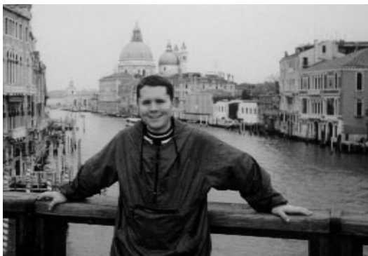
Overlooking Grand Canal in Venice, Italy