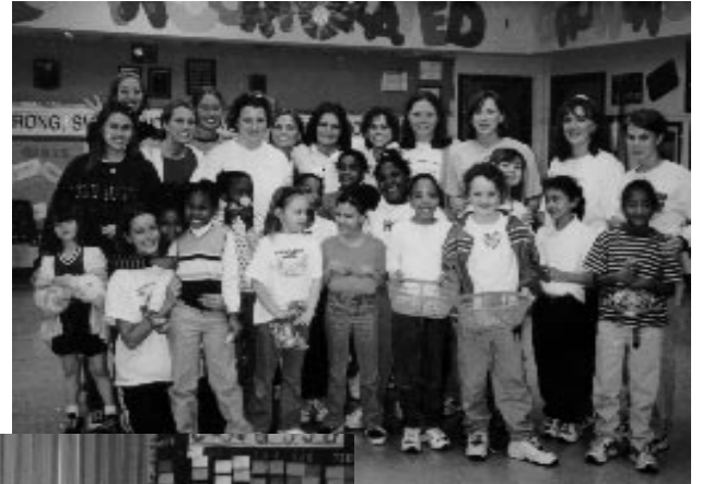
Kappa Delta sorority members visit Girls, Incorporated each month to work with the girls.