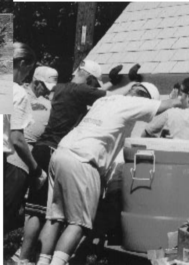
KWC freshmen learn to work as a team as their Foundation group moves a shed for Habitat for Humanity.