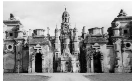
Harlaxton with the "Haunting" movie additions to the building