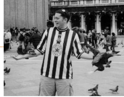
Plaza in Venice, Italy

Wanting to get more KWC students involved in the program, Frodge said, "It is fun and a good experience. If you