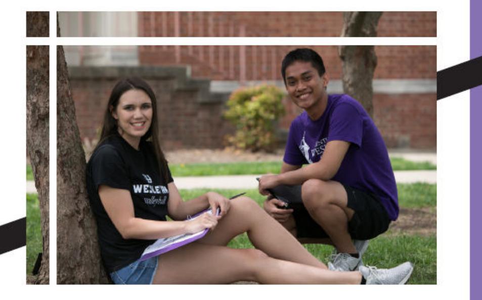
GET YOUR EDGE

There are no fees for being a part of The Wesleyan Edge and the benefits can be invaluable!